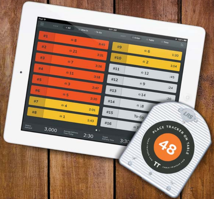
Table Tracker is a table location system that identifies where guests are sitting so you can deliver food faster.