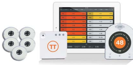
Table Tracker Pro

At Jason's Deli, Table Tracker hasn't just made delivering food easier, its made it faster. The implementation has produced immediate improvement, reducing ticket times by a full minute. Instead of searching for guests, food runners know exactly where customers are sitting so they can deliver food immediately. Table Tracker also helps Jason's Deli collect important information about its food delivery times. Using Table Tracker's reporting tools, Jason's Deli store managers and corporate employees can identify trends and pinpoint opportunities for improvement.